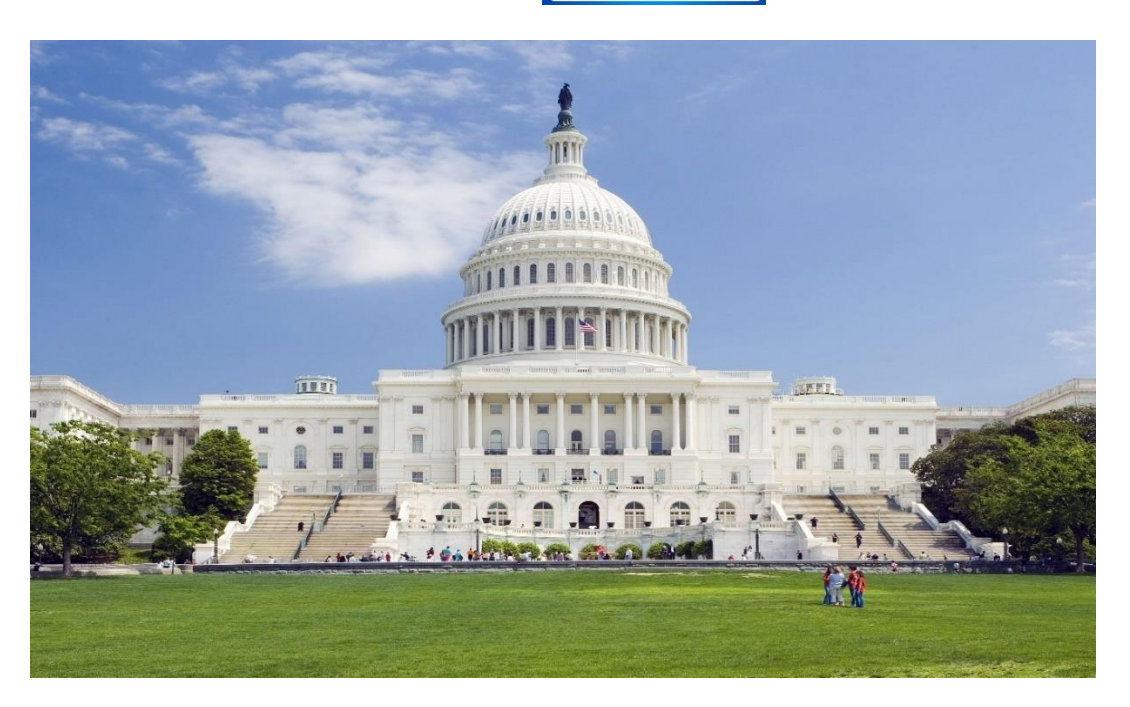
Day 3: Proceed to Washington, D.C., the capital of the United States of America. On arrival, visit the Smithsonian Air & Space Museum. Later, proceed for a city tour of Washington, D.C., with a local guide.

Today Check out and proceed to Washington, D.C. On arrival, proceed to the Smithsonian Institute, the world's largest museum complex, which includes the National Air and Space Museum. Touch the piece of Moon Rock; see the actual cockpit of the Boeing 747; and you may also buy the special pen used by astronauts. Later, enjoy an informative tour of this historic and beautiful city with your local guide. See the Capitol—the U.S. Congress building; the White House—the official residence of the President of the United States; the Lincoln Memorial—the steps where Martin Luther King Jr. gave his famous speech; the Korean Memorial—dedicated to the Korean War, where India had been a member of the U.N. Army; the Martin Luther King Jr. Memorial—the full-size statue and his famous quotes. Overnight in Washington. (Breakfast/Lunch/Dinner)