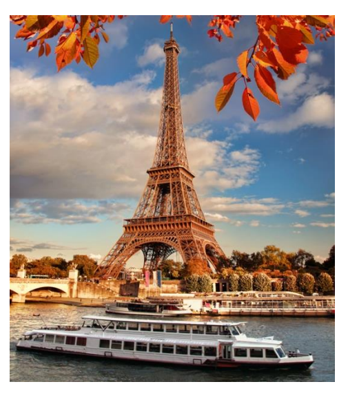
Day 2 Guided city tour of Paris. Visit to Eiffel tower 2<sup>nd</sup> Level. Enjoy a romantic cruise on River Seine. Visit Fragonard French perfumery

Hello! Today, we begin our adventure in Paris, a renowned city known for its exceptional fashion, renowned museums, breathtaking landmarks, and captivating cabaret scenes. Upon reaching your destination, our tour manager will extend a warm welcome, assist you with hotel check-in, and be available to support you throughout your stay. Overnight in Paris. (Dinner)