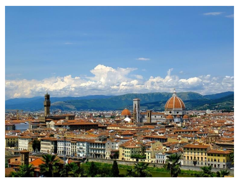
Day 8 Photostop at PiazzaleMichelangelo.

This morning, as you complete the check-out process at your hotel, we will commence our journey to