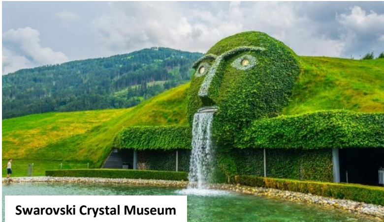
Swarovski Crystal Museum

crystals. Visit Innsbruck – The Tyrolean capital of picturesque Austria.