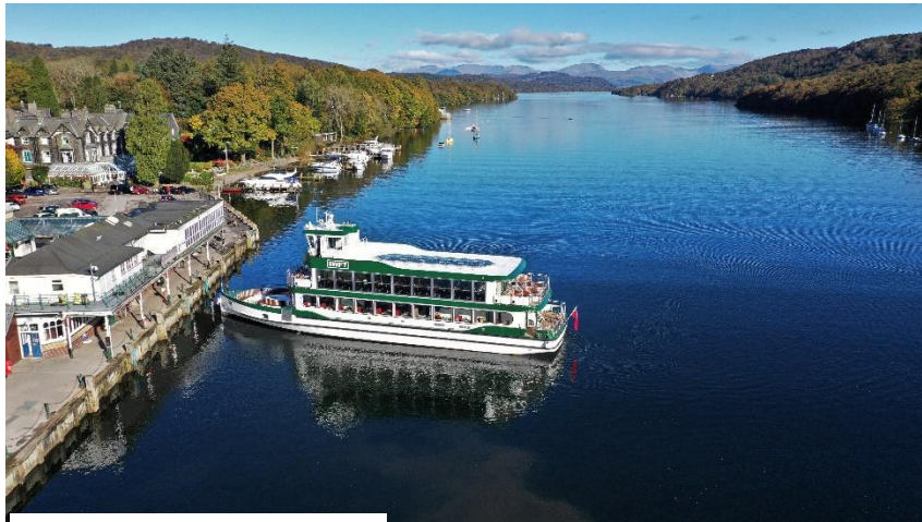
Lake Windermere Cruise

Today morning, check out and relax in the coach and embark on a whisky-tasting tour of the Scottish Highlands to experience how whisky is made and the process of creating the finest Scottish whisky. Later, we visit the tranquil Lake District, considered the finest of England's National Parks. Enjoy the Windermere Lake Cruise,