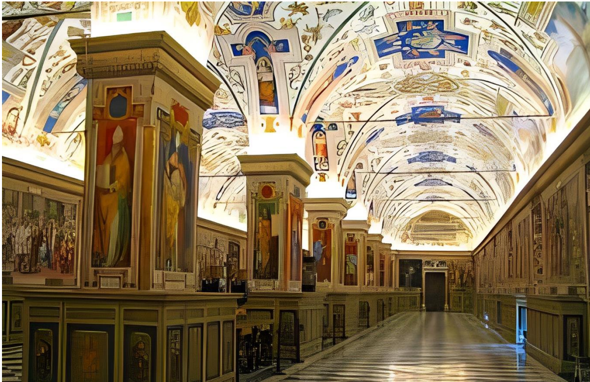
Vatican Museum with Sistine Chapel