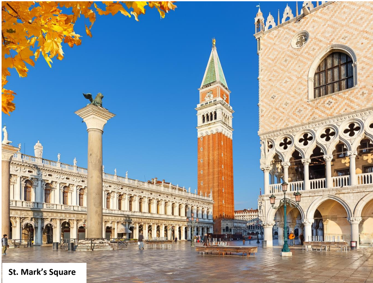
St. Mark's Square