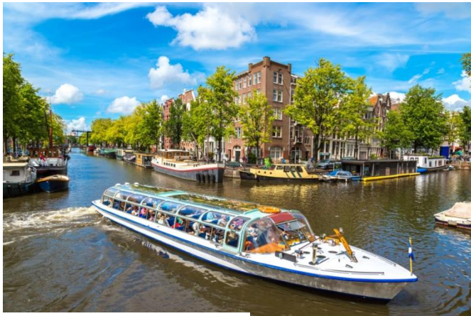
Amsterdam Canal Cruise