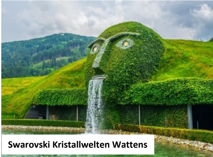
Swarovski Kristallwelten Wattens

Drive to Vaduz, the capital at the Principality of Liechtenstein with a guided mini train ride. Visit Swarovski Crystal Museum – the dazzling world of crystals. Visit Innsbruck – The