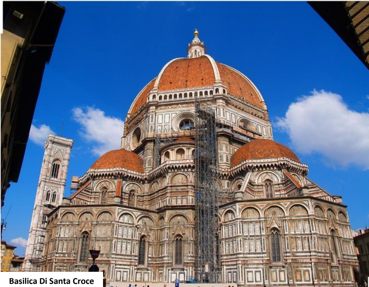
Basilica Di Santa Croce