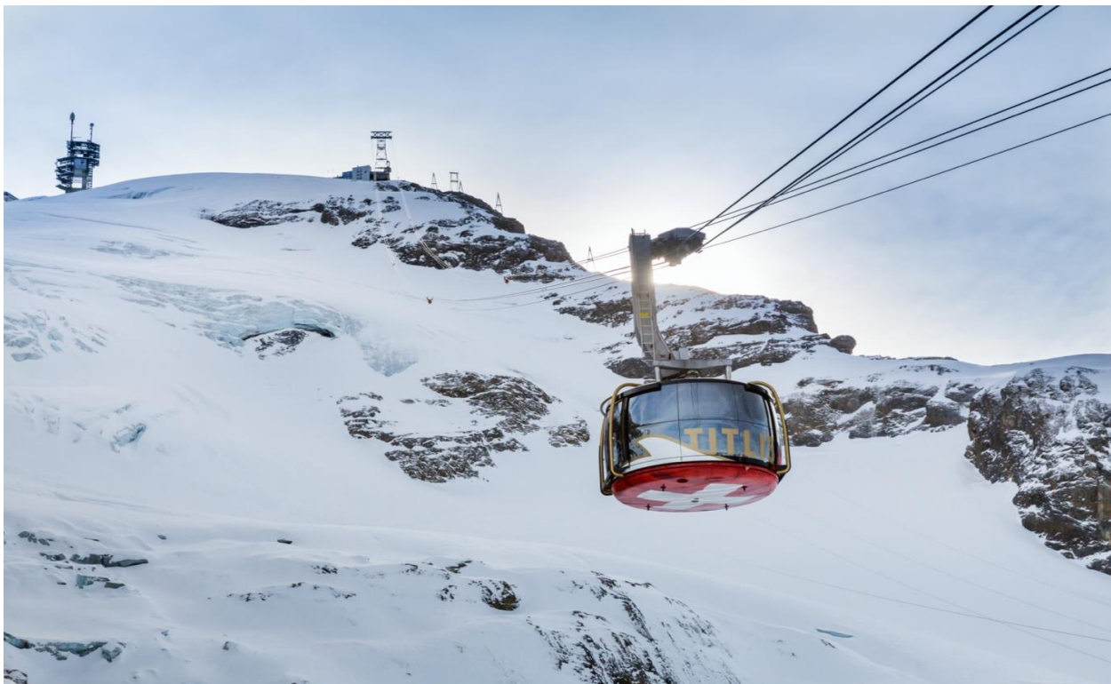
ROTAIR to Mt. Titlis