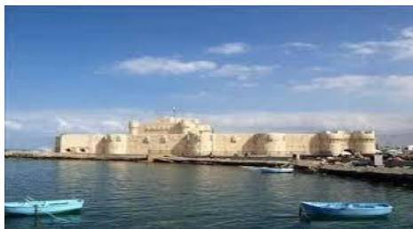
Photo stop from outside for Qaitbay Fort: It is a 15th-century Islamic fortress built to protect the city from invading Crusaders. The Qaitbay Citadel is located in the northeast part of Pharos Island, on the exact spot that was once home to the famous lighthouse of Alexandria. The Citadel was originally established by Sultan Al-Ashraf Sayf al-Din Qa'it Bay in 1544 as a fortress.

Visit Pompey's Pillar , which is an approximately 25-meter-long red Aswan granite column with a circumference of 9 meters and was constructed in honor of Emperor Diocletian. It was once a magnificent structure rivaling the Soma and the Caesarism.